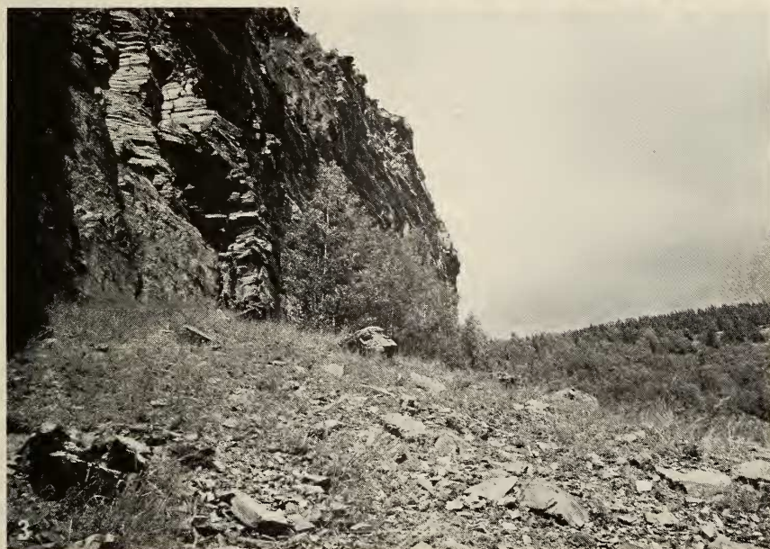
Figs. 1-3. The locality at Vinstra where Scrobipalpa reiprichi occurs.